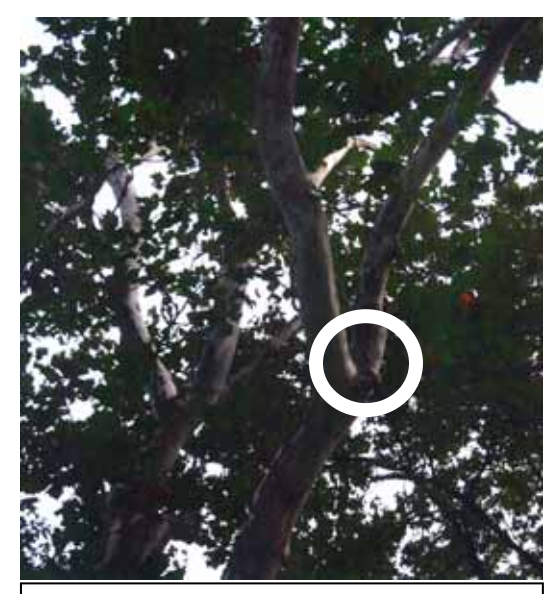
Figure 2. Tree in which incident tree limb was wedged.

The decedent's coworker was in the Ford tractor parked approximately 30 yards north of the tree being felled. The decedent made a Humboldt style notch cut of 63/4 inches horizontally on the south side of the trunk at approximately 32 inches from the base of the stump. The decedent then executed the back cut down diagonally at an approximate 45 degree angle to approximately 6½ inches into the tree from the north leaving approximately 0.5 inches of hinge wood (Figure 3).