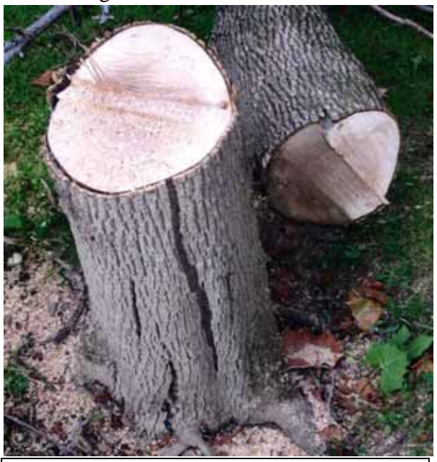
Figure 3. Felling technique of incident tree

desired path). The area where he retreated to is identified in Figure 4 as the stand of trees where the golf cart is located. The tree stopped falling. The decedent returned to the tree and made an additional horizontal cut from the south into the existing hinge wood leaving approximately ¼-inch of hinge wood.