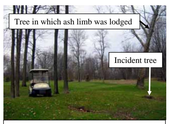
Figure 4. Golf cart shows location of decedent's first retreat into stand of trees

The decedent retreated to the north as the tree began to fall. Apparent interference from the adjacent tree to the north in which the falling tree's limb was lodged resulted in the ash tree