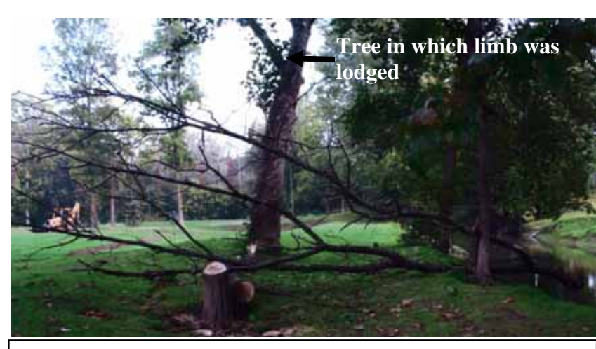
Figure 1. Overview of incident scene, facing north

The decedent and his coworker were in the process of removing eight dead ash trees on the course. The incident ash tree was assessed and damage noted approximately 36 feet above the ground. Additionally, one of the ash tree's limbs was