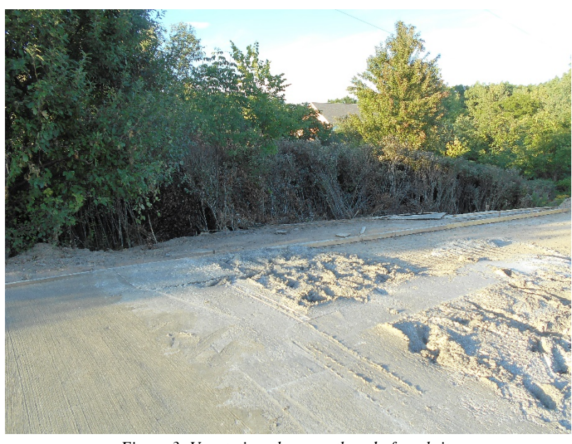
Figure 3: Vegetation along north end of worksite

The power lines had been noted during an initial site assessment the previous week he had noted the power lines. Similarly, the MIOSHA investigation found