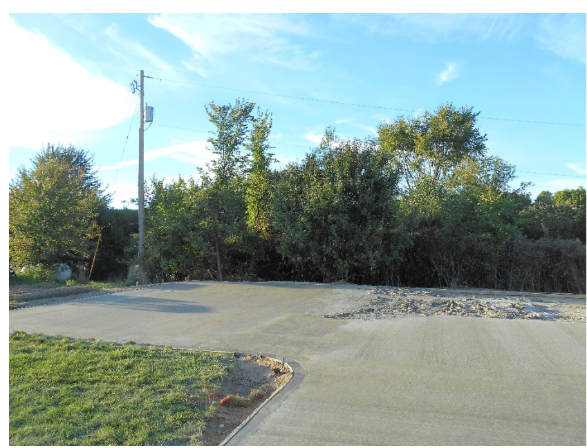
Figure 1: Overview of incident scene

back (north) when the incident occurred. A line of brush was approximately 8 feet away from him under the power lines, which may have required him to elevate the bull float handle rather than pull it in a more horizontal position. The decedent was wearing non-electrical rated rubber boots over his leather work boots, vinyl work gloves, hard hat and safety glasses. When the bull float handle contacted the overhead line, the decedent fell forward, letting go of the