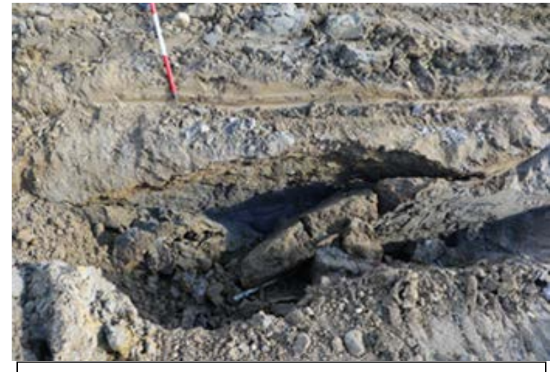
Figure 3. Trench wall collapse

SERIOUS: EXCAVATING, TRENCHING AND SHORING, CS PART 9: