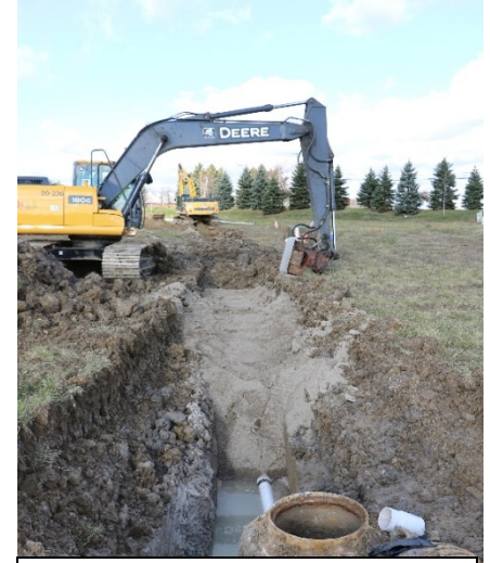
Figure 2. Water location in trench

The foreman, Coworker 1 and Coworker 2 jumped into the trench and freed the decedent from the chunks of dirt/clay, pulled him out of the trench, and laid him down on his back. They found his shovel by his side. The coworkers called for emergency response. The decedent was having trouble breathing, so they then