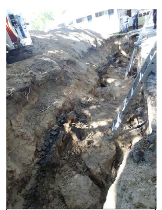
Photo 1. Overview of incident scene near driveway trench wall collapse, looking north.

Weather Underground was utilized to check the weather conditions on the day of the incident. The weather on the day of the incident was approximately 74 degrees Fahrenheit, 50% humidity, calm winds and fair skies; it had not rained on the day of the incident. The historical summary indicated periodic heavy and light rain for several days prior to the incident. [Weather Underground]